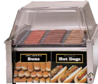
Model 30SBB with Sneeze Guard