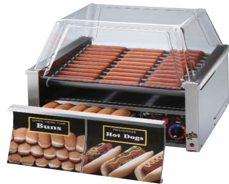
Model 50BB with Sneeze Guard