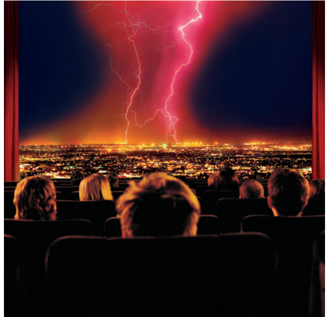
One trillion discharges a second – XBO® lamps provide high-resolution images and greater luminance.