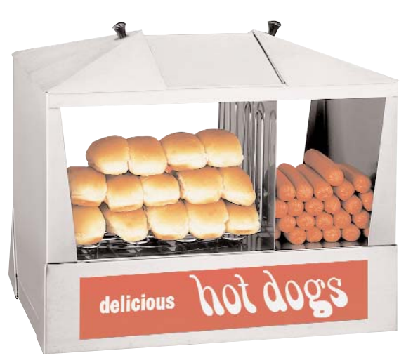
Model 35SSC Customer Side

Classic Steamro Jr. hot dog steamer is covered by Star's one year parts and labor warranty.