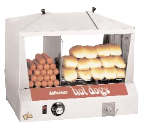
Model 35SSC Operator Side